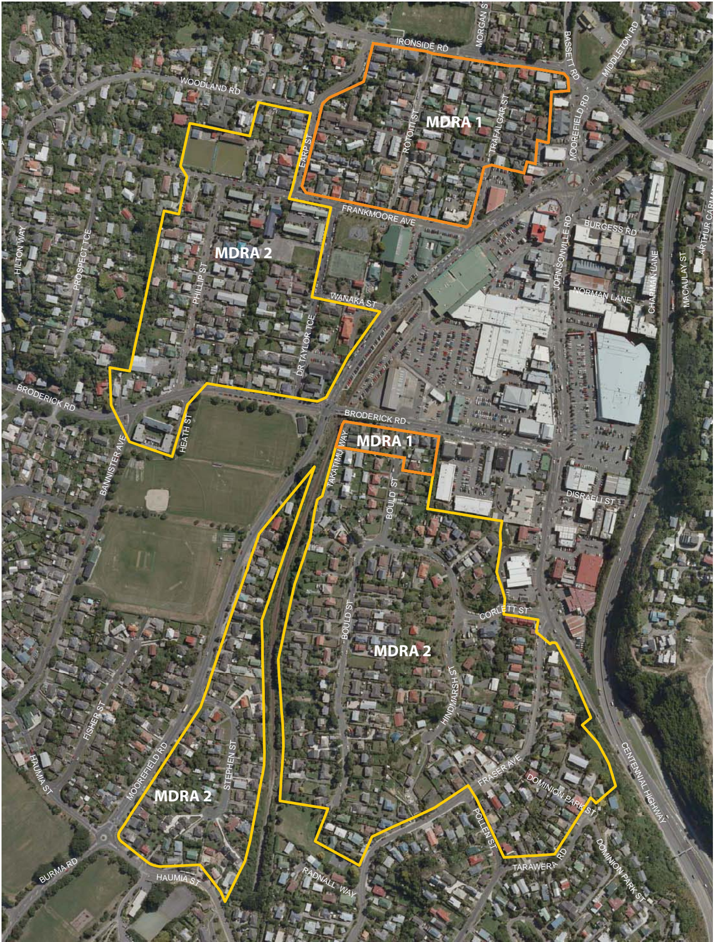
Extent of Johnsonville MDRA 1 and 2