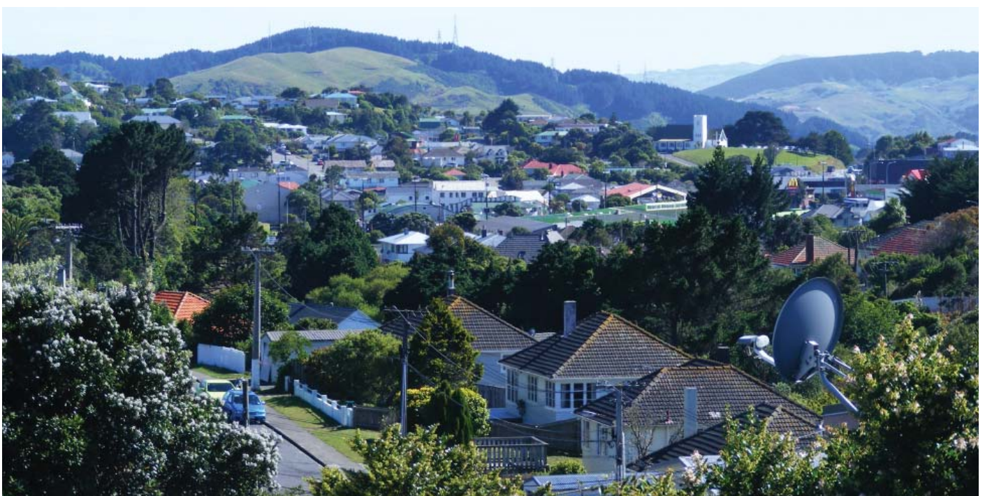
View towards Johnsonville MDRA (in the foreground) from Haumia Street.

Note: The above table is a summary of key provisions applying to the Johnsonville MDRA 1 and 2. Chapter 5 of the District Plan contains a full list of rules and standards applying to all residential developments.