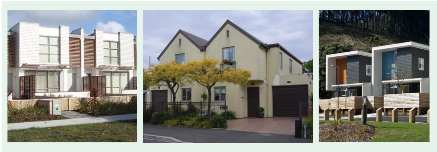
Examples of semi-detached houses