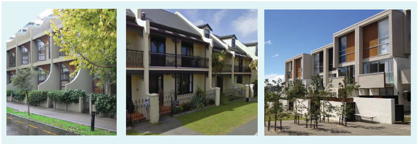
Examples of terraced or town houses