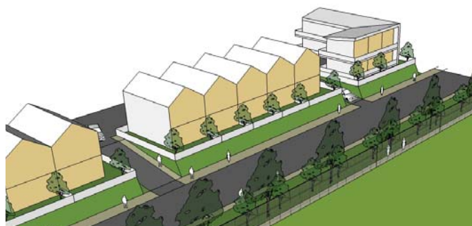
Diagram 2: Where buildings sit above the Connecting Streets , landscaped slopes create a green interface with the public footpath.