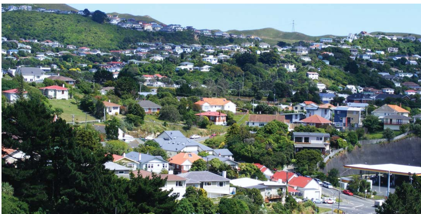
View towards Johnsonville MDRA (in the foreground) from Creswell Place.