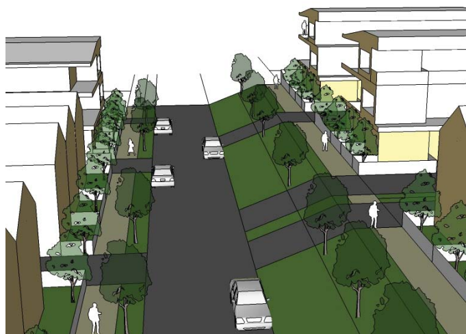
Diagram 4 - Future character of Bould Street (north) with higher buildings creating a transition towards the town centre.