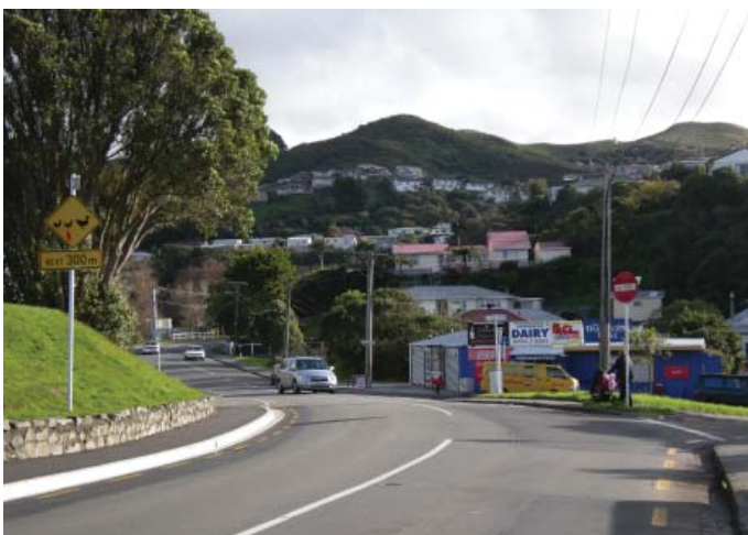
Broderick Road west of Moorefield Road

New buildings along Connecting Streets may also be set back by less than the minimum 3m front yard required in the District Plan to create a strong built edge along these streets and a high level of visibility between the buildings and activities on the street. This will also contribute to safe pedestrian routes.