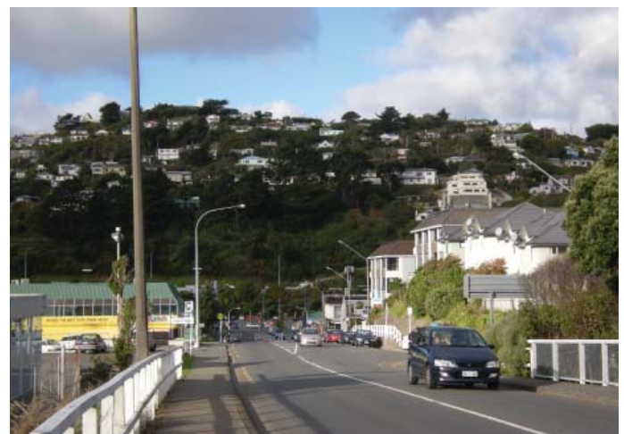
Broderick Road east of Moorefield Road