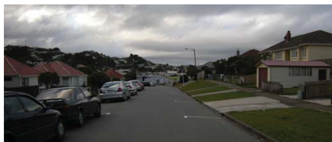
Existing character of Bould Street (north of Hindmarsh Street)