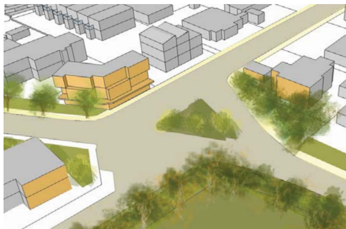
Diagram 3: Where buildings are located at a street corner, they should address both street frontages with windows.