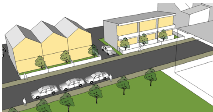
Diagram 1: Small building setbacks are appropriate along the wide Connecting Streets .