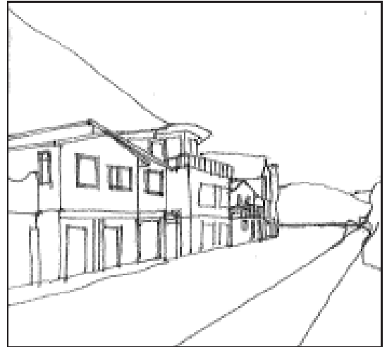
Strong edge definition

Where there is no setback, the visual connection between the inhabitants and the public life of the coastal road is further intensified.