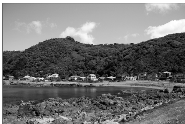
Strong relationship between the natural and built environment

The contrast between the built elements that are compressed to a ribbon between vegetated escarpments and the openness of the coast gives the area a special character that contributes to Wellington city's sense of place and its collective identity.