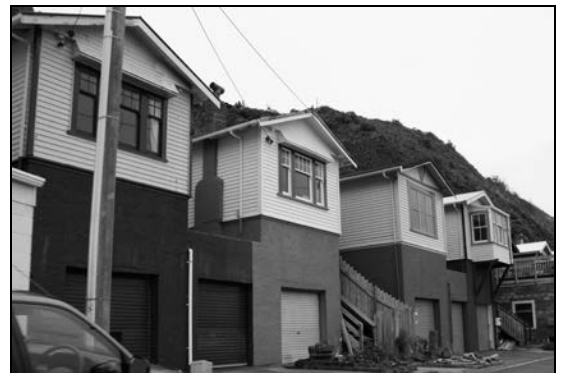
Car parking is typically under or at the back of dwellings

Car parking is typically in garages and generally integrated with the building on the ground floor of the residence or provided for at the back of a building. Accessory buildings in front of dwellings are generally discouraged.