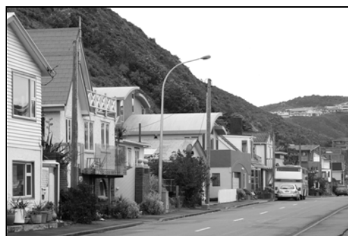
Overall diversity in form, type and style

The Residential Coastal Edge has a diverse building character with no pronounced consistency of building form, type or architectural style. Buildings range from typically single storey bach style cottages or bungalows, to Victorian villas, to contemporary modern houses that are generally on two (or more) levels.