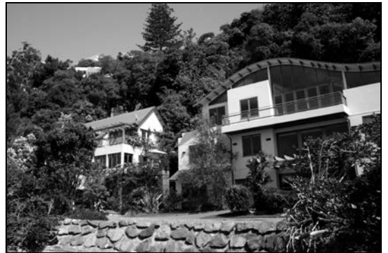
Mixture of roof forms

The Residential Coastal Edge is characterised by a mix of roof types including skillion, curved and papapet/flat, gable and hip roofs.