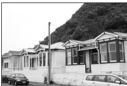
Small groupings of consistent styles

While most of the coastal edge has a diversity and visual complexity of residential styles and materials, there are two recognisable groupings of buildings with consistent styles - one at Karaka Bay and the other at Island Bay. These groupings were all built pre-1910. Some are villas of relatively consistent style and form.