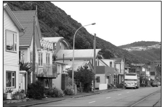
The minimal setbacks have lead to very shallow or no front gardens

Where there is a setback, most properties have front fences which continue the line of the road edge. These are generally at a height that still enables a visual connection between the residents and the public.