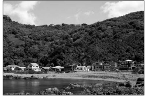
Strong relationship between the built environment and the escarpment

Buildings are generally limited to the flat area of each site in front of the escarpment. This reinforces the effect of concentration and intensity along the street edge.