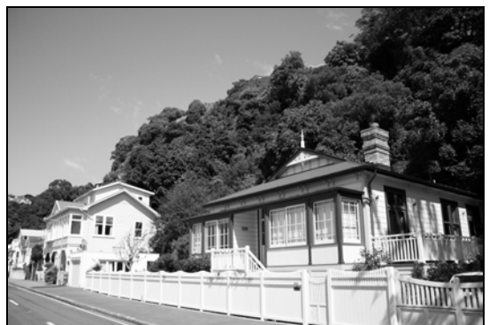
Buildings are generally orientated towards the road

Although there is a diverse range of building types there is a commonality of design features throughout the area such as (often large) windows, entrances, decks, balconies and their attendant living spaces that are orientated toward the road.