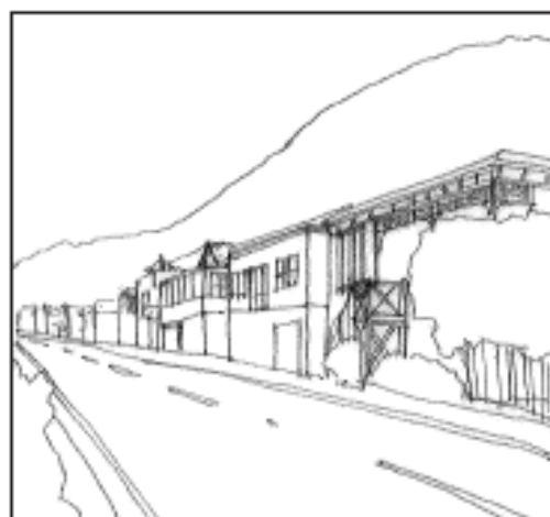
The area is a mixture of one and two storey dwellings

The generally consistent heights of one or two storeys (only a few are taller) above street level along the Residential Coastal Edge generates a clear line in perspective and also serves to accentuate the linear coastal edge and define the escarpment above.