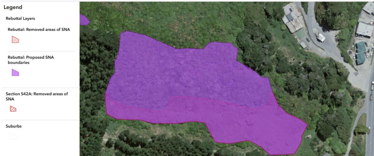
Figure 2: boundary amendment as shown in “Wellington City Significant Natural Areas Dashboard for S42A report” as at 12/09/2024.

In regard to other submissions that could be contrary to a boundary adjustment that reduces an SNA area, we would like to put forward the following: