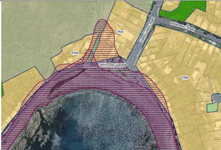
Screen snip of WCC PDP, with Coastal Inundation and Tsunami Hazard Overlays turned on (High Hazard Areas)