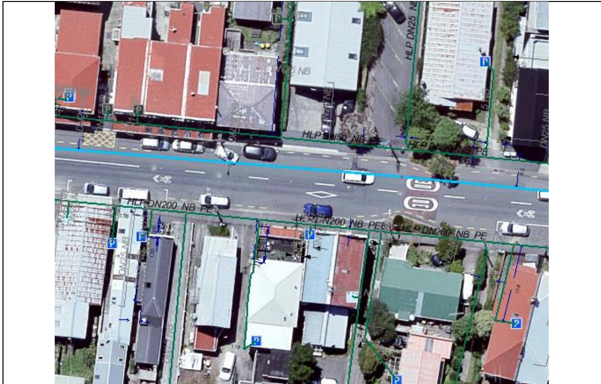
Screen Snip from Powerco GIS. The blue line represents a Strategic gas main, while the two green lines on either side of the road are gas mains that connect to local customers