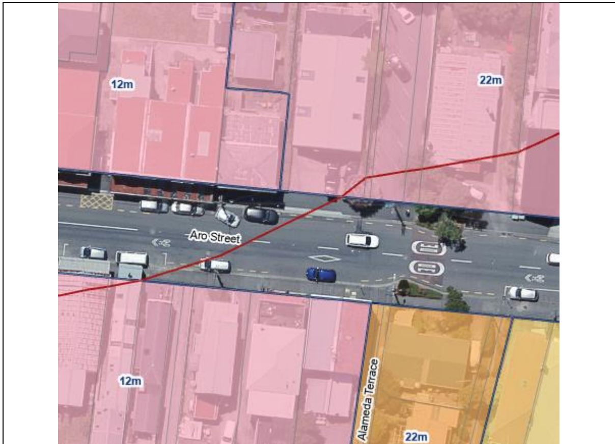
Screen snip of WCC PDP, with SASM Lines layer turned on – Aro Street