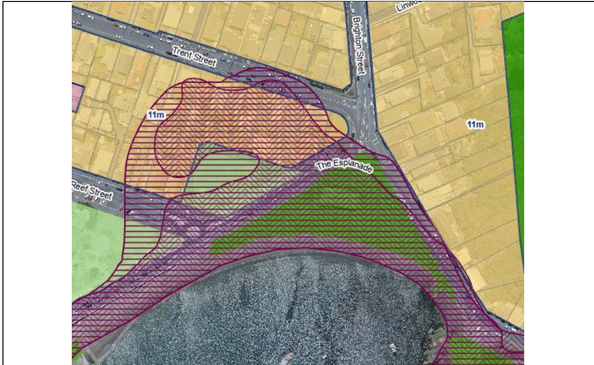
Screen snip of WCC PDP, with Coastal Inundation and Tsunami Hazard Overlays turned on (High Hazard Areas)