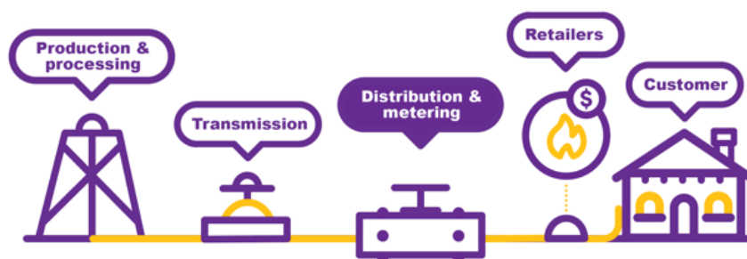
Figure 1 - The New Zealand Natural Gas System