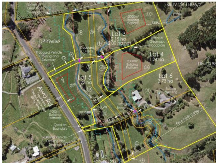
Figure 3: Proposed Subdivision at Awa Road, Kumeu (Proposed Lots 3, 4, 5 and 6): Source: Developers subdivision plans

The pipeline easement, which runs north to south, is shown by the orange areas labelled 'A', 'S', 'AA', 'AB', 'B', 'C', and 'F'. 51. Proposed Lot 5 is subject to gas pipeline easement in favour of Firstgas. The pipeline easement is located at the rear of the lot, and this is separated from the road frontage (Awa Road) by a waterbody. Physical access to the pipeline easement is therefore not possible within the new legal boundaries of Proposed Lot 5. 52.