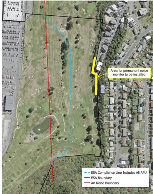
Figure 6 — NOISE: East Side Precinct Compliance Line and Noise Monitoring

c. The operation of unscheduled flights required to meet the needs of any state of emergency declared under the Civil Defence Emergency Management Act 2002 or any international civil defence emergency.