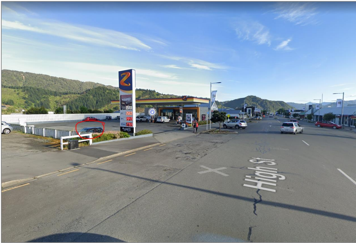
Figure 2: Google Street View Image (image captured October 2022). Facing the Z Energy Picton Site. The Red circle indicates approximate location of the proposed EV charging infrastructure.