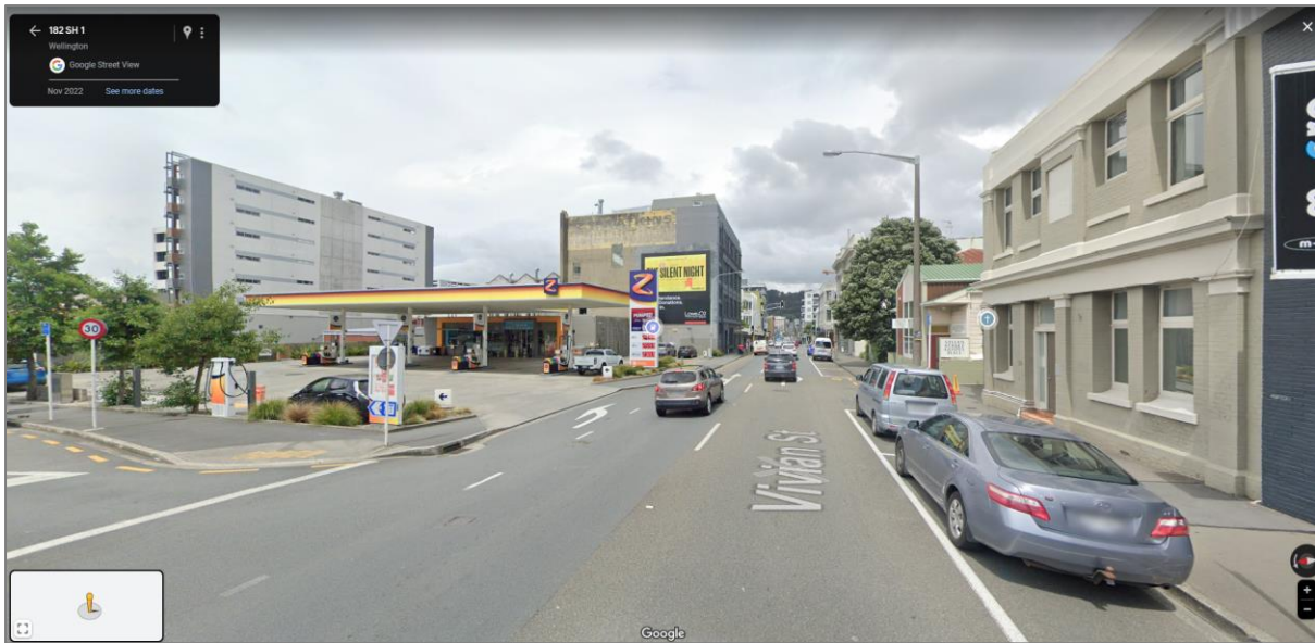
Figure 2: Google Street View Image capture facing east on Vivian Street / SH1, image captured in November 2022.

10.22 There may, however, be other unintended consequences for other types of existing land uses that do not require such visibility of forecourts and signage. An example may be where an existing commercial site in the LCZ, which contains the Active Frontage Control (and therefore does not have a minimum building height standard), is looking to redevelop its storage and refuse area so as to be housed in a new structure or enclosed by a fence. This is a common and non-fanciful activity in my view and is applicable to service station activities also. To avoid a resource consent, if that refuse store (being a structure as defined in the PDP) is placed on the front boundary identified as the “Active Frontage”, the activity is permitted under Standard LCZ-S6 and Council holds no discretion to request, on urban design or any other grounds, the structure is kept to the rear of the site. Moreover, if there is existing landscaping at this site, which could include established trees, that will require removal to comply with the standard 32 .