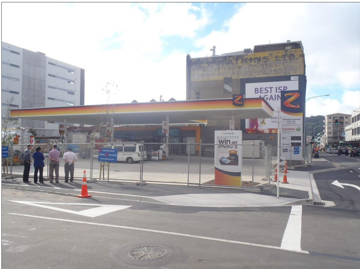
Figure 1: Photo of Z Energy Vivian Street Service Station located on the corners of Vivian Street (SH1) and Claytons Avenue. Photo taken in 2013 during the “opening” of the service station following a comprehensive redevelopment of the site.

10.21 In the context of Z Energy's submission, which raised questions as to how these standards could be applied to an existing service station development, a minimum 22m high building (Standard CCZ-S4 as addressed in Section 9) located up to the road frontage could seek to achieve compliance with these standards. However, when applied to an existing service station could result in a built form and streetscene effects that is not anticipated within these zones for the reasons set out in para 10.19. I have provided a photo and a Google Street View image of the existing Vivian Street Service Station below to assist the argument from a visual perspective. The service station is located in the CCZ under the PDP and the Vivian Street road frontage (on the right-hand-side in Figure 1 below) contains the Active Frontage Control and the Verandah Control. Whilst still operating, my opinion is that it is not an efficient or effective outcome to require buildings to be located on the Vivian Street road frontage at an existing service station such as this one.