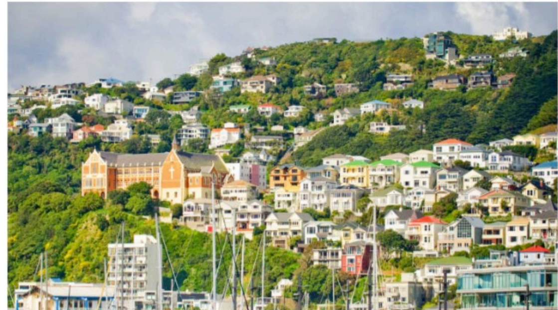
Mt Victoria, seen from the Wellington waterfront.