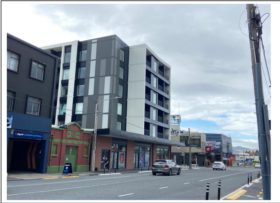
Hauwai Apartments - 93 one and two bedroom apartments just completed on Adelaide Road by Wellington Company and Taranaki Whānui ki Te Upoko o Te Ika set an example for the future if incentives are there.

Make Adelaide road a special urban renewal priority zone! Go six stories !