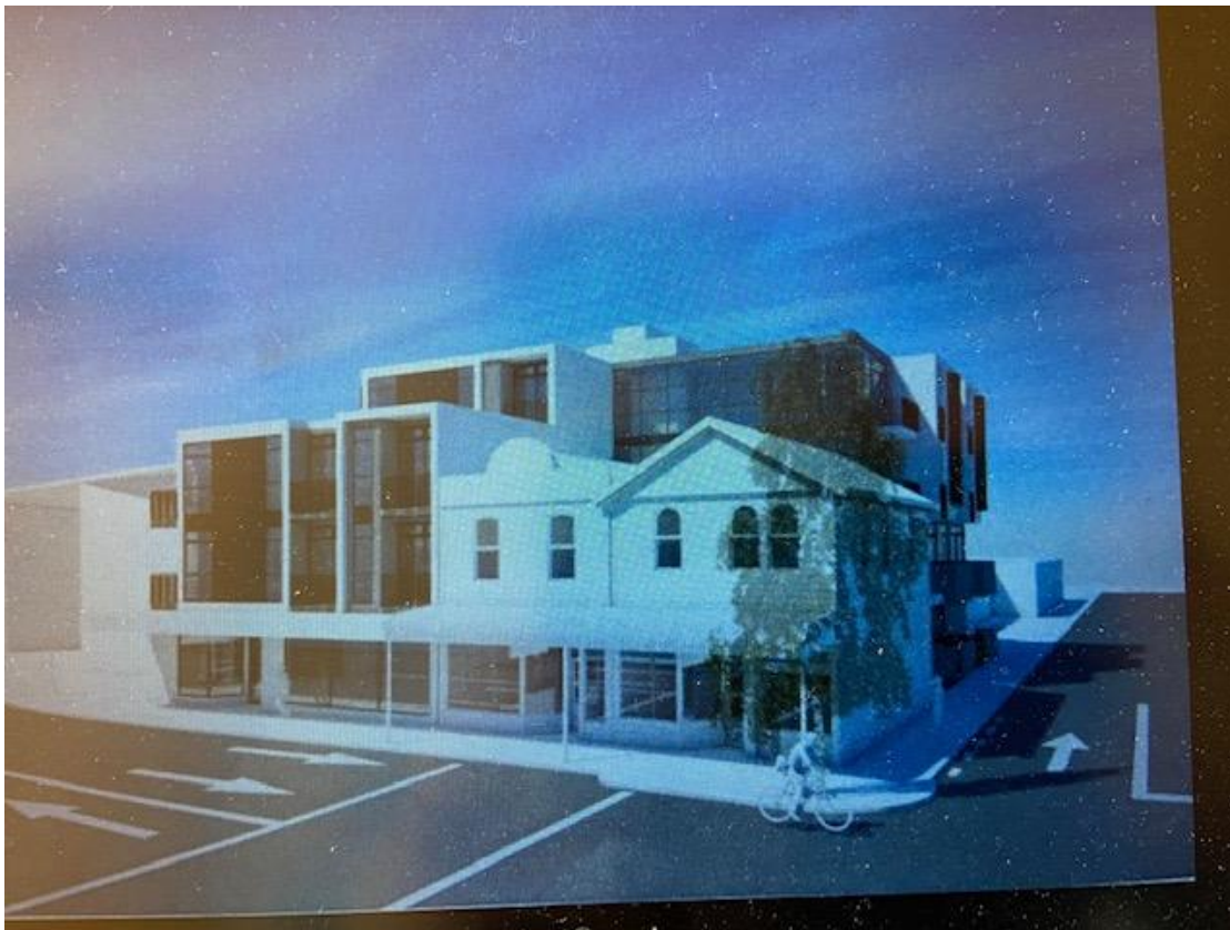
A new housing and shop development in process for corner of Riddiford and Emmett Sts. A model for things to come if WCC makes it easier for developers to do density in suitable places.