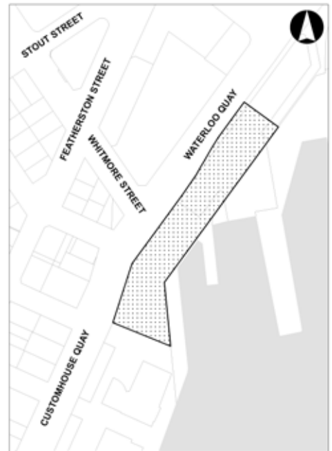
North Kumutoto Precinct

There are an infinite range of design solutions as to how a building could sit in Block A, B or C and there needs to be design flexibility that can respond to these locations; hence the requirement of exceptional design that will deliver on the intent of this design guide.