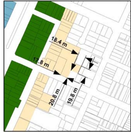
Kent Terrace 1:4,000