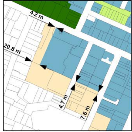
Webb St 1:4,000