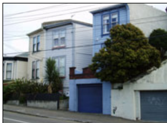
Defined street edge with buildings typically aligned with the street grid