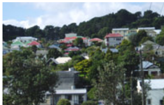
High intensity development is typically compensated for by mid-block open space with mature vegetation

High intensity of development is typically compensated for by mid-block open space, created by the aggregation of rear yards, often with mature and visually prominent vegetation.