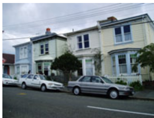
Consistency of character and a high degree of visual unity