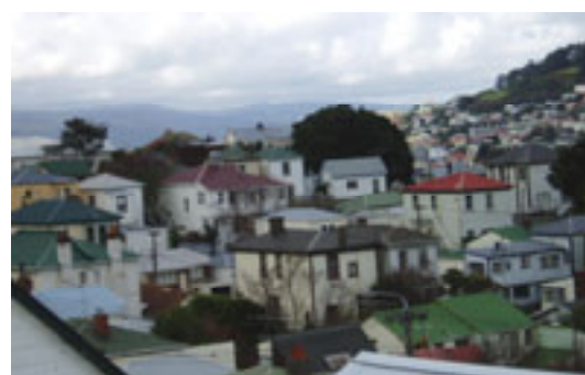
Intricate roofscape demonstrating consistency of roof type and pitch