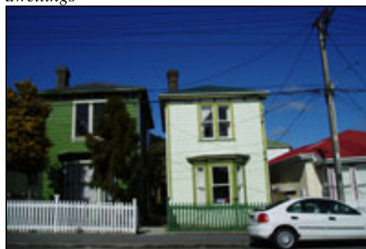
Common building dimensions