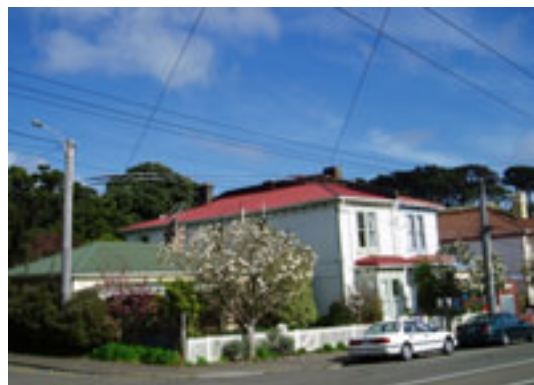
Limited range of building types