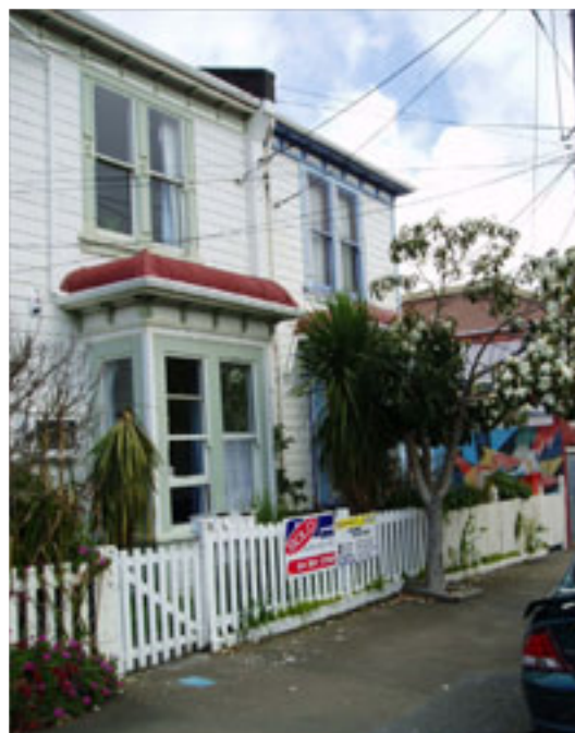
Neighbouring buildings, aligned with each other give a strong street edge definition

Variation of front yard dimensions usually relates to variation of topography. Dwellings on sites sloping steeply up from the street typically have deeper frontage setback than those on flat or downward sloping sites.