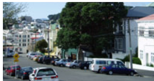
Carparking is typically on the street

Most of the existing garages are found along the higher side of streets. Garages on steep frontages, typically built into the slope and located in front of and below the dwelling, have a lesser impact on the streetscape than free-standing garages.