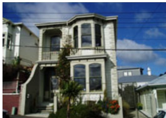
Entrances and main windows addressing the street

Currently most building exteriors are light in colour. However, houses built during the 1890-1910 period were traditionally painted in deeper colours with strong contrasts used to enhance decorative detailing and roof forms.