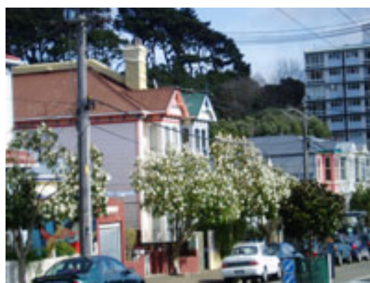
Distinctive local character with a strong sense of place

At the same time, the area exhibits a sense of visual diversity. This is derived from variations in roof form and building height, often accentuated by topographical variation and further enhanced by the presence of non-residential building types.