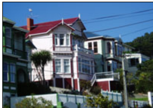
The undulating topography is a strong determinant of the area’s overall character

The area contains a relatively small number of multi-storey apartment blocks and town house developments of variable scale and layout. Most of the multi-unit development is located along or close to major streets and/or on larger or former industrial sites.