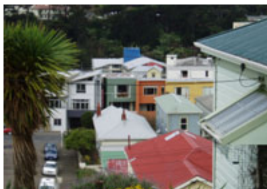
New multi-unit development around Tasman Street