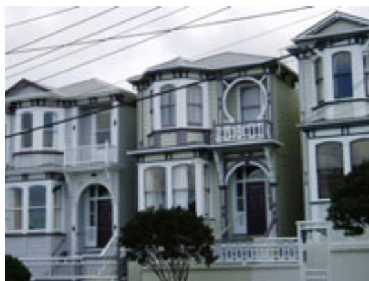
Wright Street - a notable concentration of original dwellings