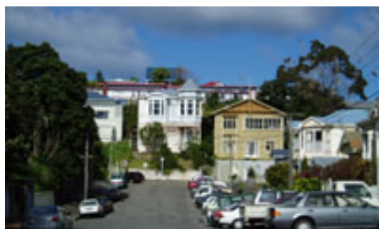
Manley Tce - an exceptionally wide cu-de-sac with a strong sense of place