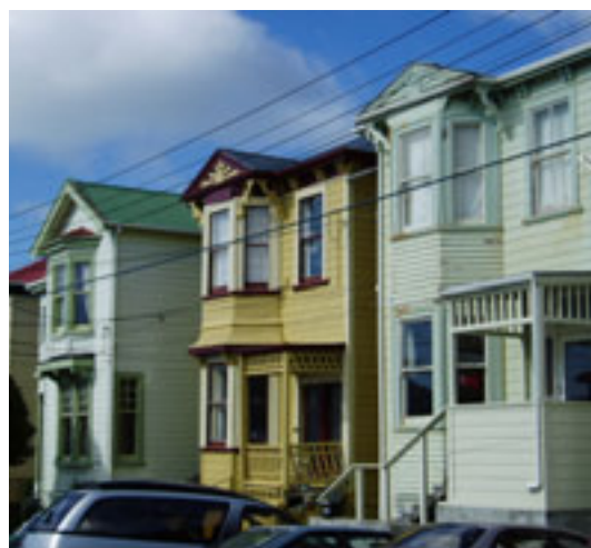
The Area is a highly intact remnant of residential housing from the first decade of the 20 th century

The general intactness of the area’s urban fabric is largely due to the relatively limited number of new developments. New development occurs primarily in the form of multi-storey apartment blocks, typical around Riddiford Street, Adelaide