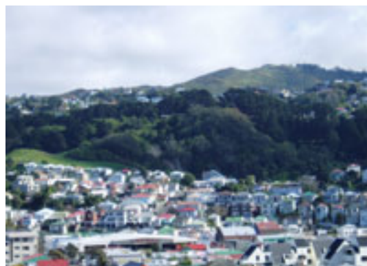
Visual diversity derived from variations in roof form, building height and topography.