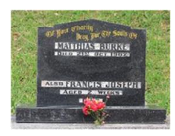
L – R: The grave of my great great grandparents in Moycullen, Co Galway (about 1830), the Moycullen Catholic Church and graveyard when my Irish grandparents, and other relatives are buried, my father, my father and brothers grave at Karori in Wellington. My NZ grandparents are also buried at Karori.