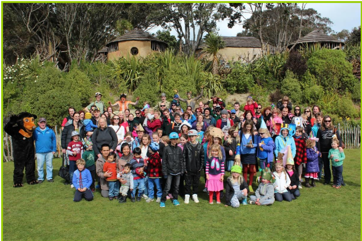
Do at the Zoo — visitors celebrating conservation week

We are part of an Australian Research Council funded project involving us together with Taronga Conservation Society Australia in Sydney and Bronx Zoo in New York to research the importance of follow up connections with visitors via the web to encourage action for the environment. This project is being facilitated by some of the world's most respected visitor experience researchers. Phase one is completed and subsequent phases will occur over the next eighteen months.