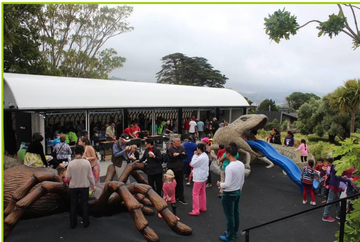
Neighbours Night BBQ — 2014

Through these initiatives and others we contribute to the Accessible Wellington Action Plan 2012-2015 by reducing social and physical barriers for our community.