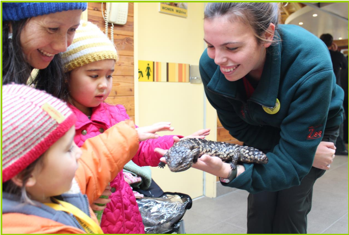
Young visitors meet a Shingleback up close

We agree to the non financial expectations of the Zoo and the SOI outlines how we will implement these expectations.