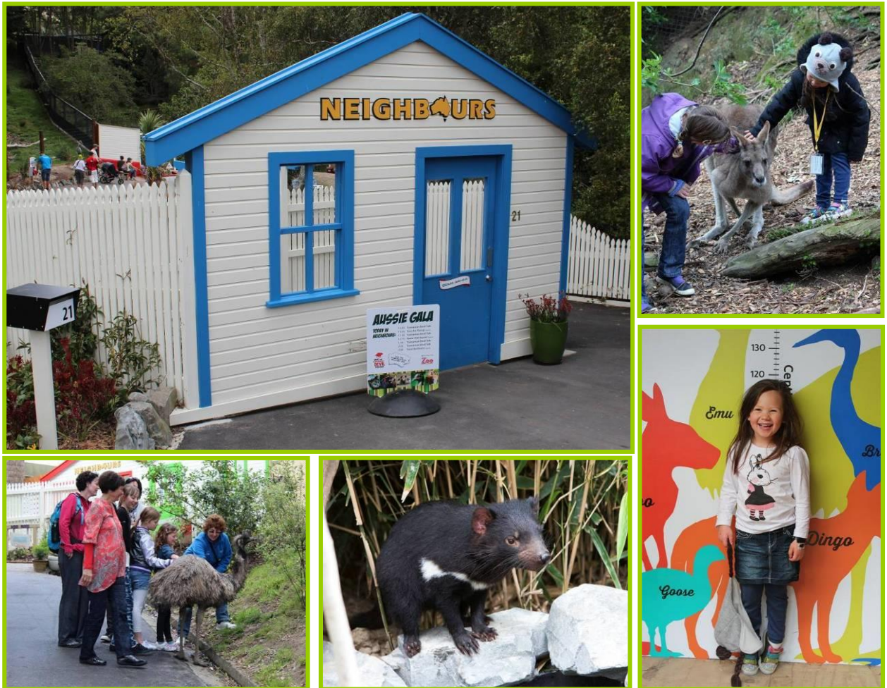
Neighbours — our new Australian precinct

Pursuant to Schedule 8 of the Local Government Act (2002)