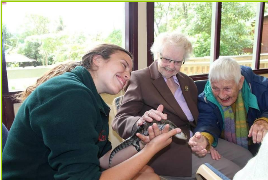
A group from Wellington City Council Housing meet a Blue-Tongued Skink

In these ways we contribute to the Our Living City Programme and the Economic Development Strategy.