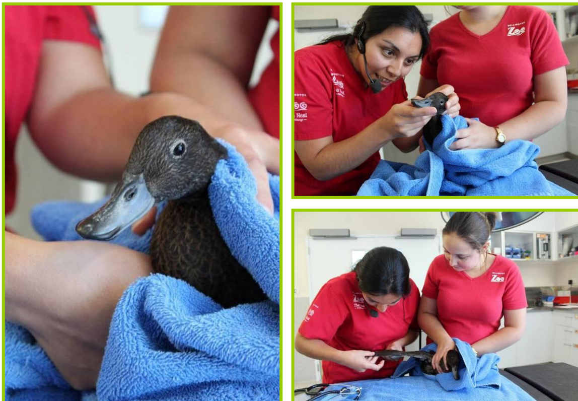
A rare Brown Teal (Pāteke) receives a health check from veterinary staff

This year we will be instigating an Animal Welfare Committee consisting of both Zoo staff and independent external experts. This Committee will be tasked with ensuring Wellington Zoo follows the Five Domains of animal welfare with excellence.