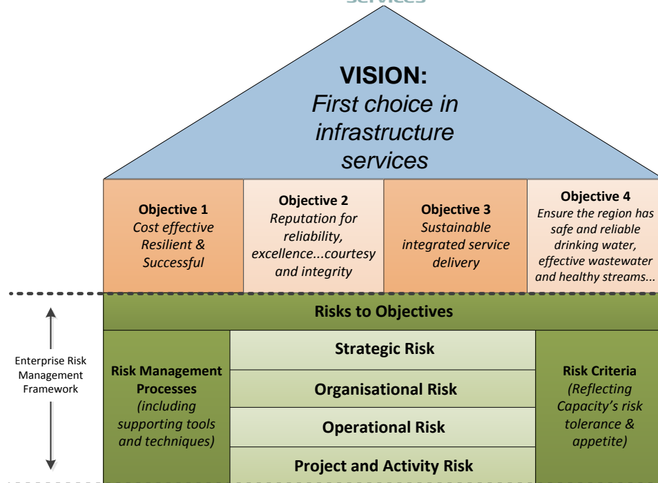
Capacity's Risk Management Framework.

In the 2014–15 year we will be reviewing our risk register based on the above framework. We will updated our procedures to require all teams to actively maintain risk profiles and discuss risks, their treatment programmes and to report on them on at least a monthly basis.