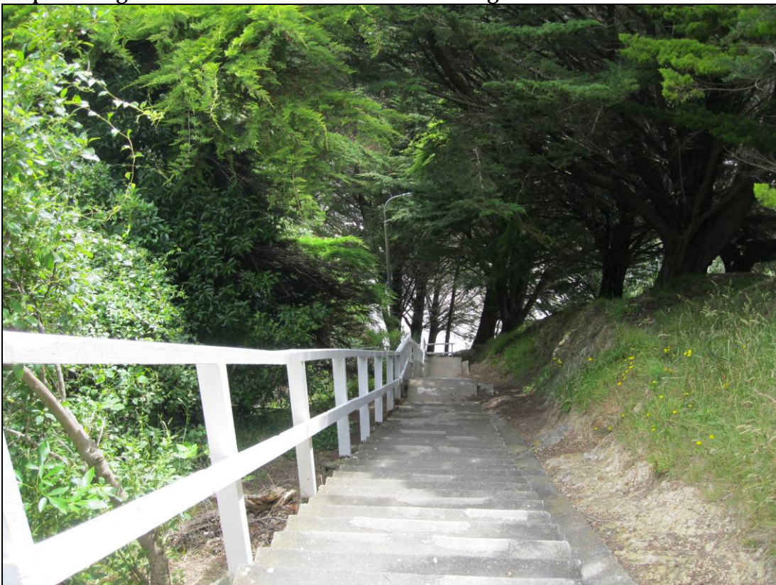
Lower access point to reserve, on Main Road, looking west.