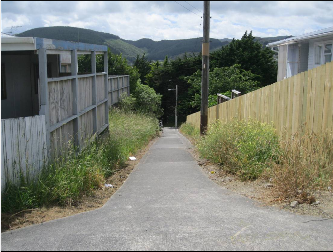
Steps through Main Road West Reserve – looking north-east.