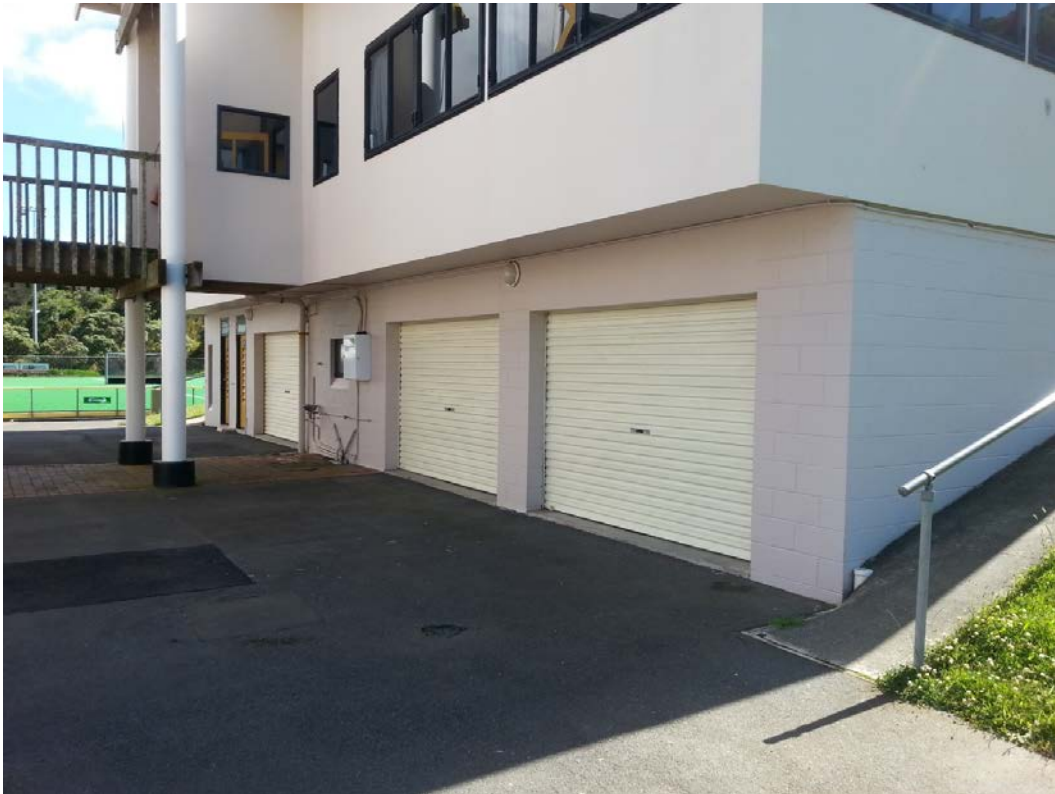
Administration Building – pro shop to be located at RHS garage door