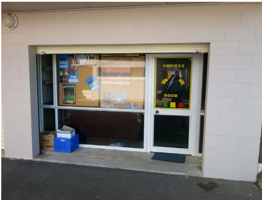
Pro shop with roller door opened