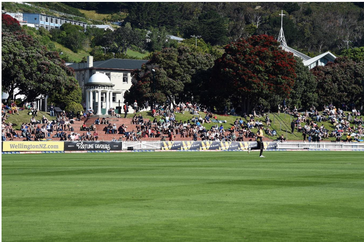
Christmas at the Basin – 21 December 2020