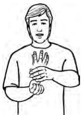
Tipu, tupu Plant