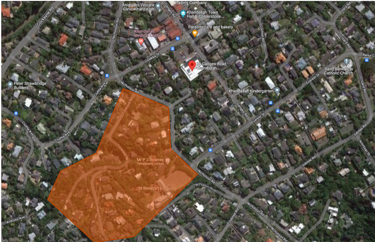
Figure 1: Pedestrian catchment likely to use Nicholson Road Access