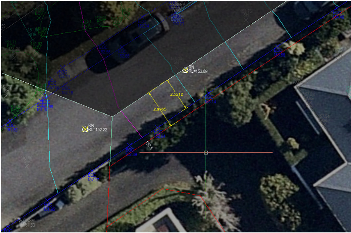
Figure 3: Existing Access Dimensions – 35A Nicholson Road