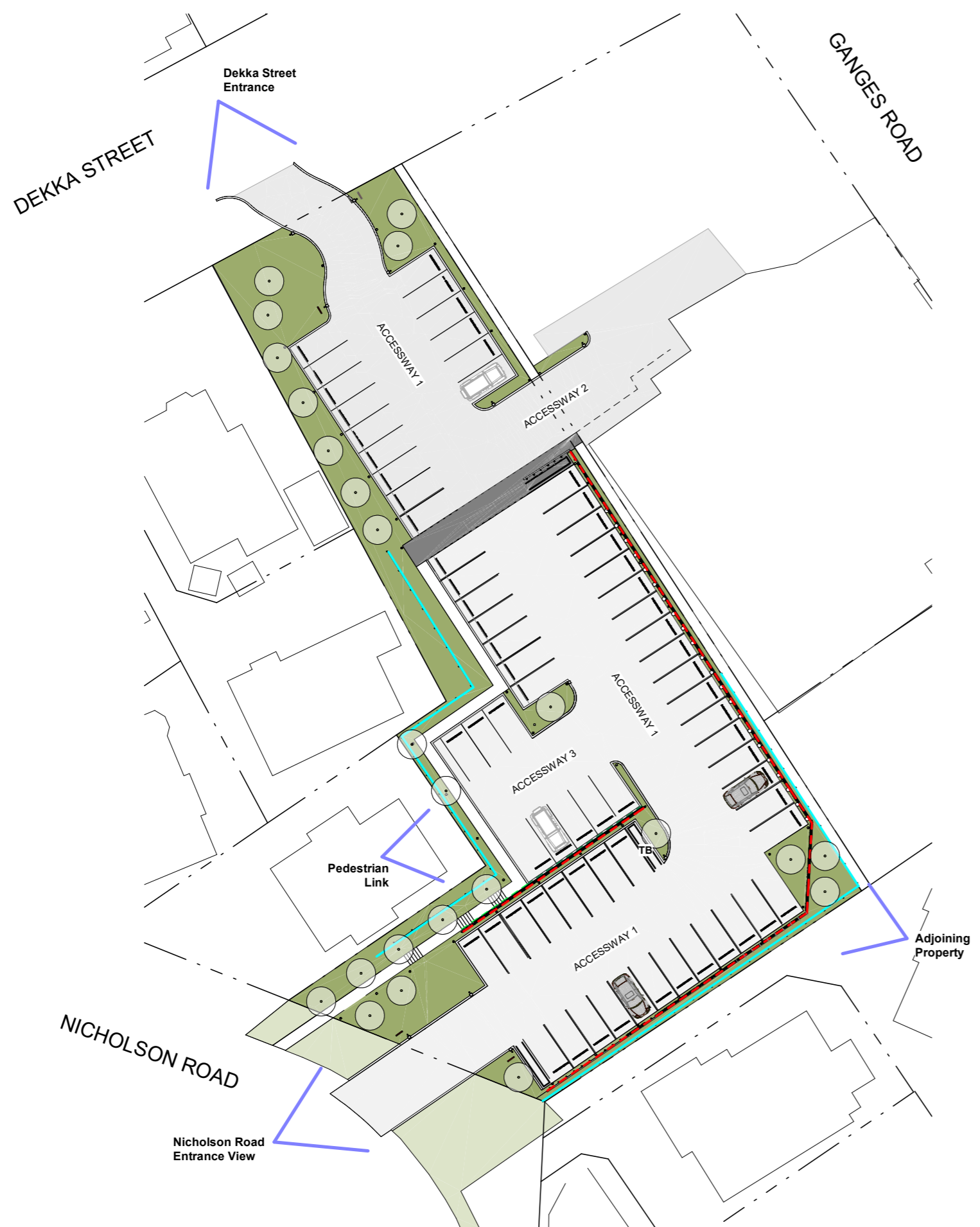
3D VIEWS KEY PLAN SCALE @ A3 - 1 : 500 | SCALE @ A1 - DOUBLE SCALE