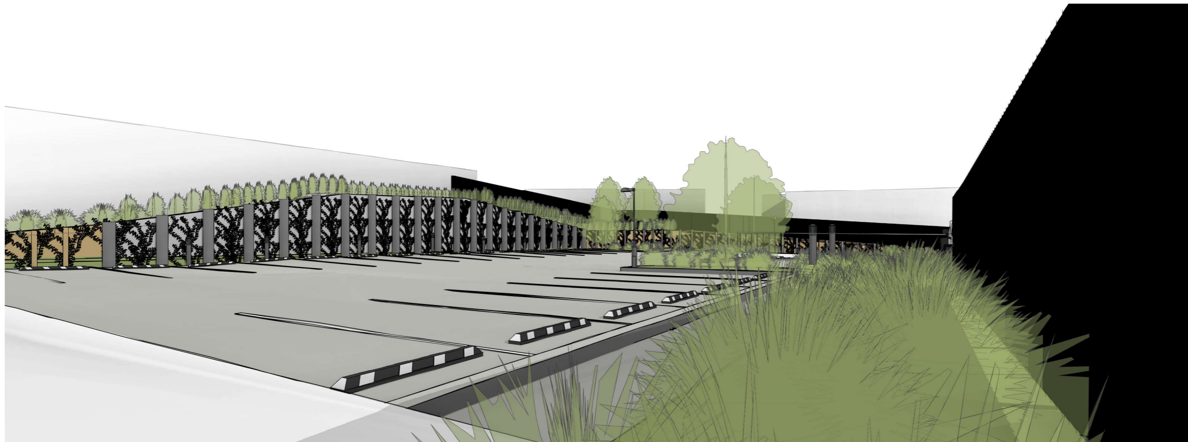
PEDESTRIAN LINK SCALE @ A3 - | SCALE @ A1 - DOUBLE SCALE

PROJECT No. F537 PLOT DATE. 25/09/2023 2:06:48 pm