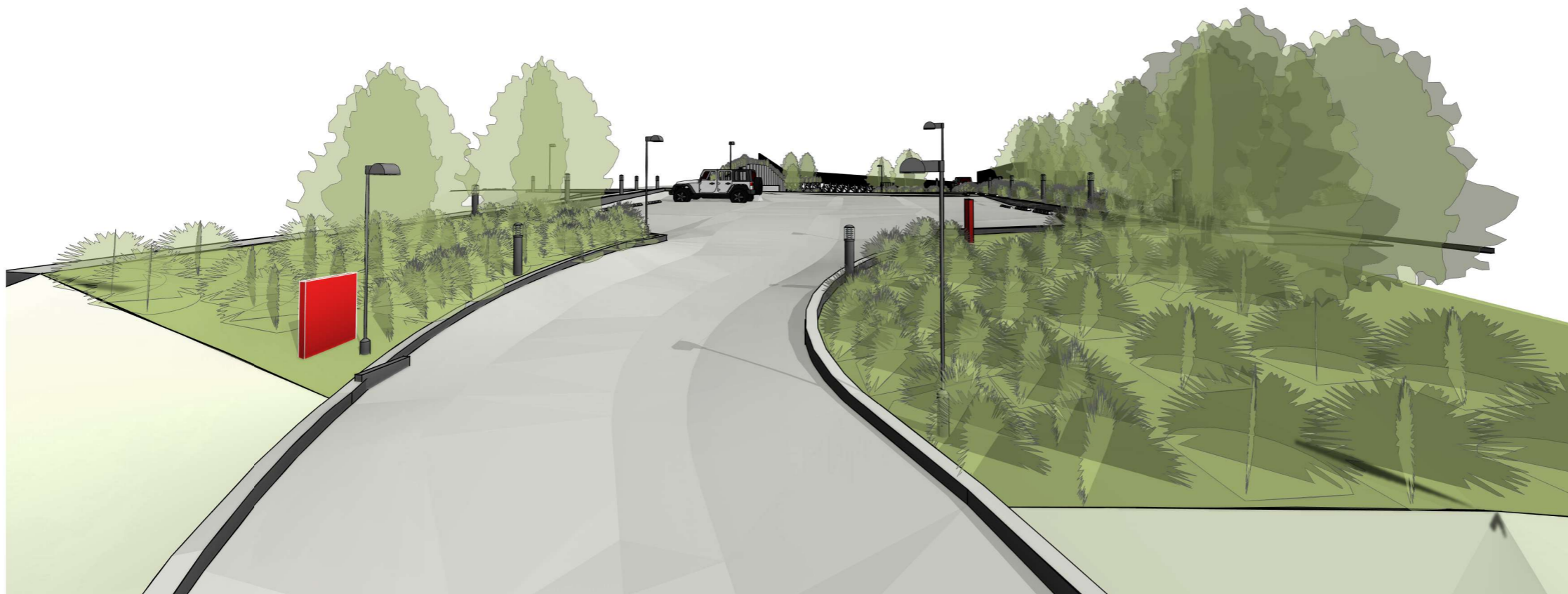
DEKKA ST ENTRANCE SCALE @ A3 - | SCALE @ A1 - DOUBLE SCALE