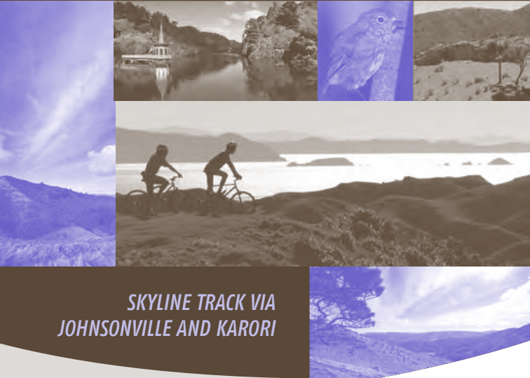
SKYLINE TRACK VIA JOHNSONVILLE AND KARORI

Discover Wellington's Town Belt, reserves and walkways