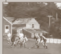
Photo: Khandallah swimming pool, tea kiosk and park, 5 January 1931 (Alexander Turnbull Library, Wellington, New Zealand).

The Northern Walkway winds down from Mt Kaukau to one of New Zealand's oldest parks – Khandallah Park, first designated as a domain in 1909. It has more than 60 hectares of native bush with 9km of walking tracks winding through dense bush and passing several lookouts.