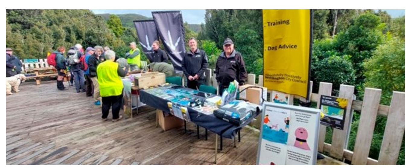
A pop-up education activation, in collaboration with Capital Kiwi.

We are committed to running more of these courses in the future as they prove to be very popular, and we receive excellent feedback from those that attend.