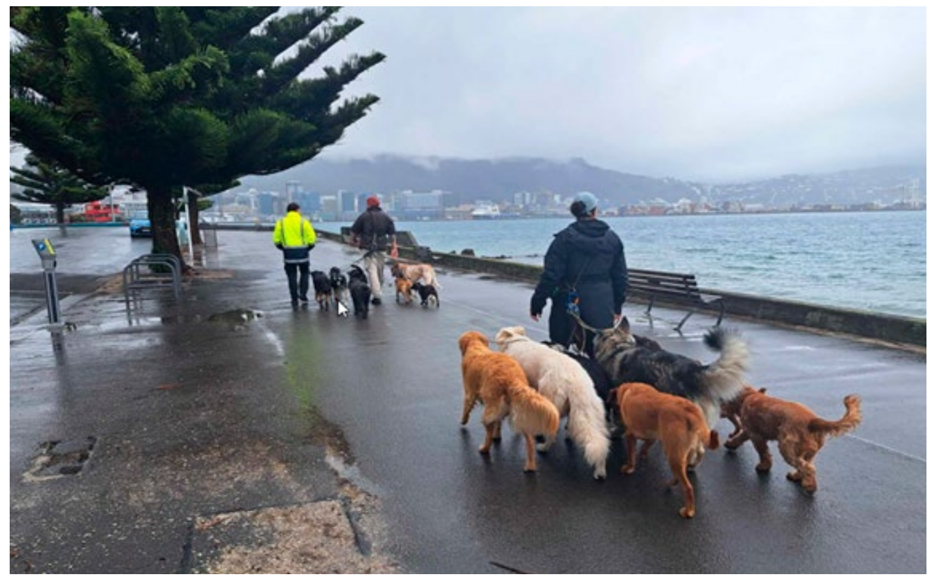
An assessment taking place in Wellington.