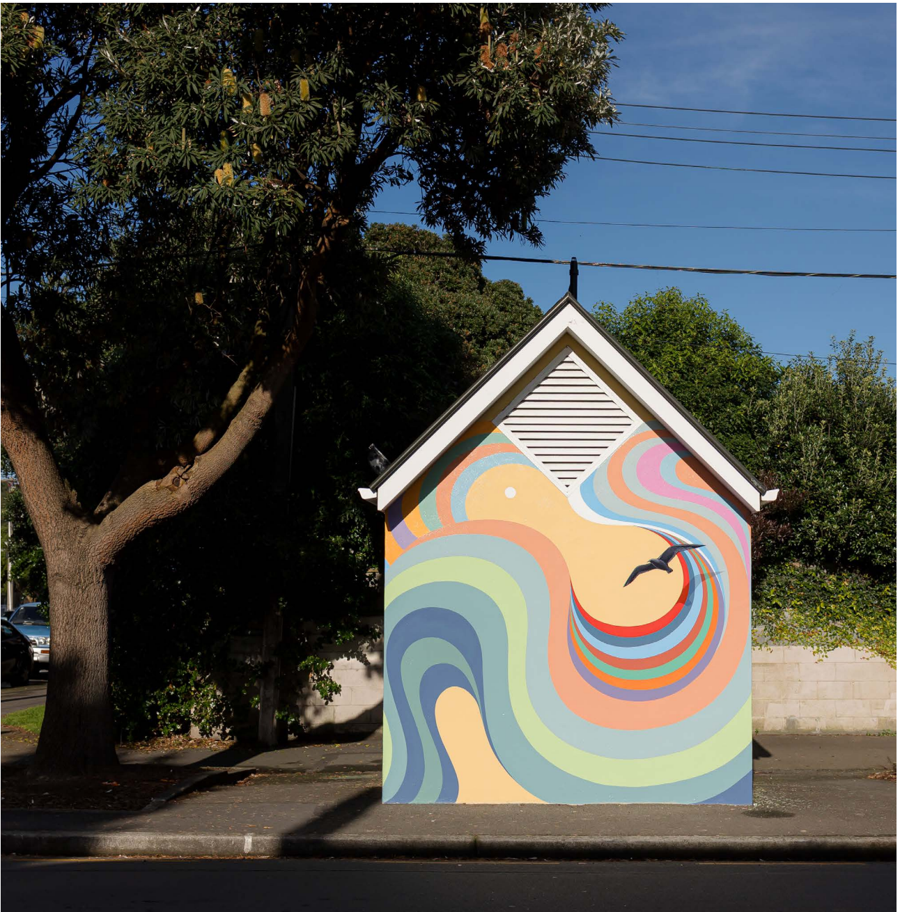
Gina Kiel, toilet block mural (detail) on Medway Street, Island Bay.